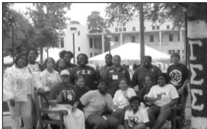
District IV attendees in front of Zeta Pi's tree.