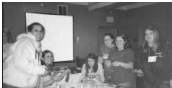
Collegiate and Alumni Members participating in the service project at Albany.

District III learned a lot that day. In addition to building a stronger relationship with the other chapters in attendance, participants were able to build on their skills through workshops on fundraising, service, recruitment, communication and more. Special activities were designed for the alumni members in attendance. In addition, roundtable discussions gave members an opportunity to offer feedback and share ideas. Attendees also participated in a fun filled service project—making holiday wreaths for residents of a retirement home. All in all, everyone left with lots of enthusiasm and ideas after a great conference experience.